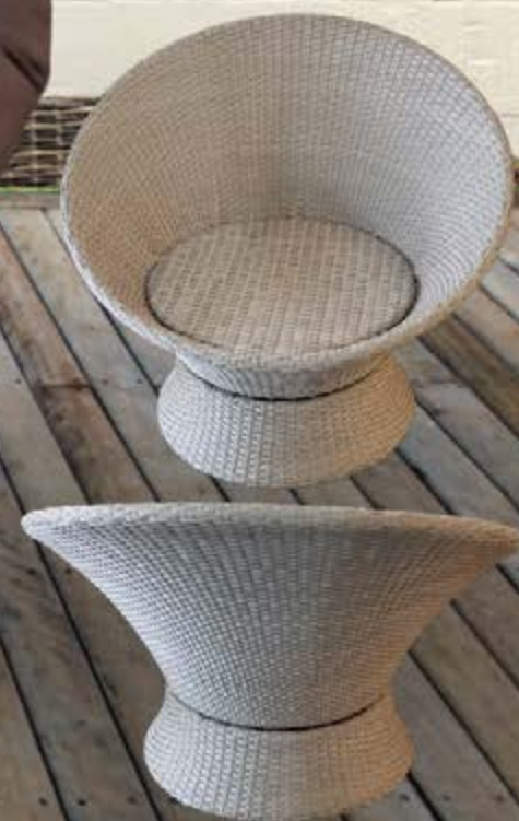
Deep seating rocking chair set w/table